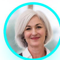
Administrators like You! Thank you for the feedback! We will always listen, respond, and address your needs!